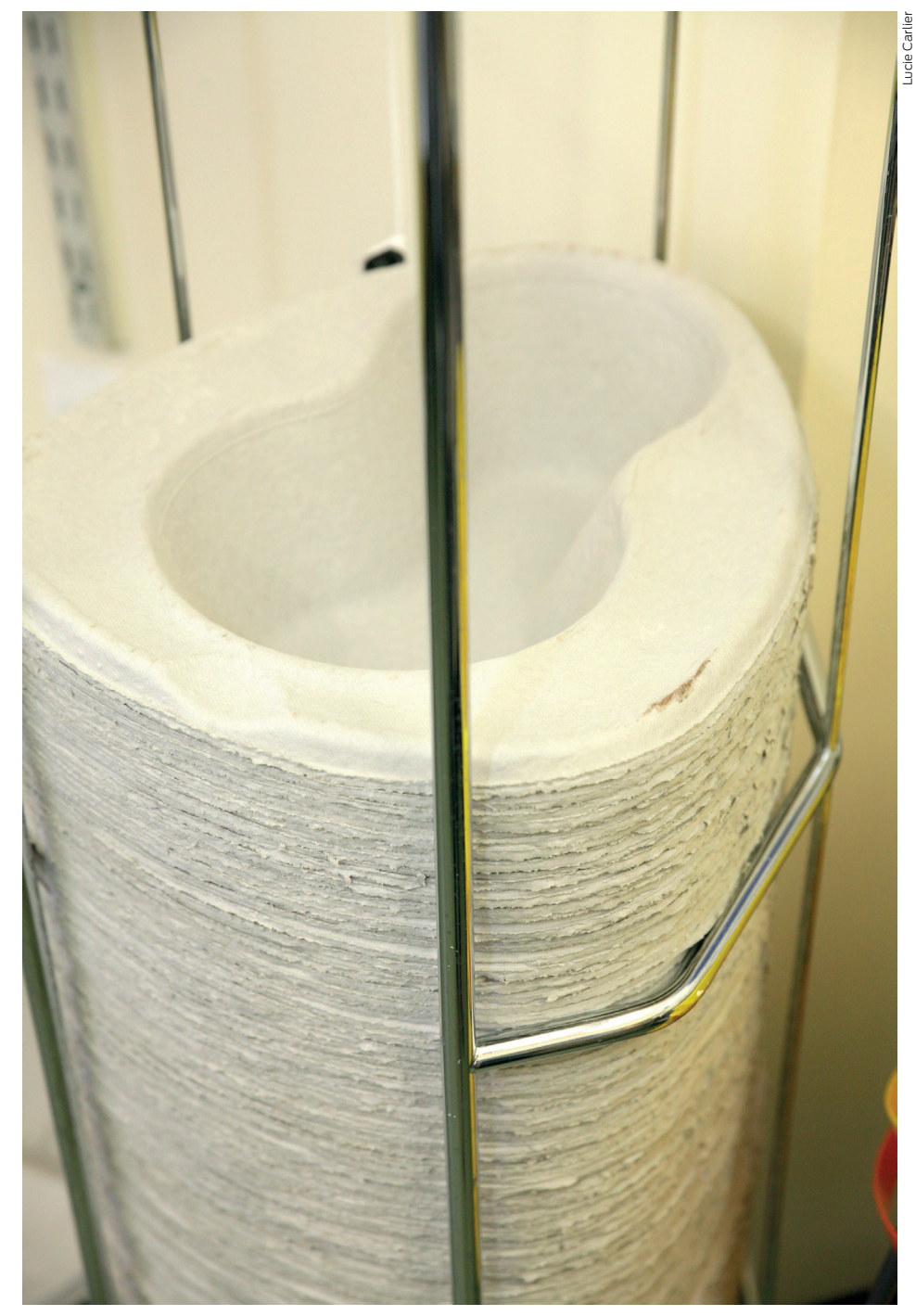
On completion of their training, nursing associates will work alongside healthcare support workers.

This paper will focus on the role identity of the TNA and qualified nursing associates, following a systematic review of the available literature and identify areas for improvement and growth in this developing role.