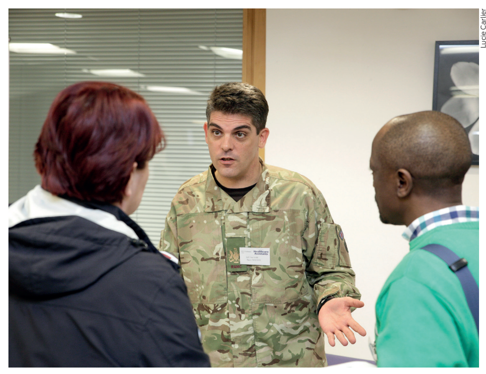
There is limited research available around the trainee nursing associate role due to its infancy.

Health Education England. Raising the bar: shape of caring: a review of the future education and training of registered nurses and care assistants. 2015. https://www.hee.i uk/sites/default/files/documents/2348-Shap of-caring-review EDUCE education and training of registered nurses and care assistants. 2015. https://www.hee.nhs. uk/sites/default/files/documents/2348-Shape-