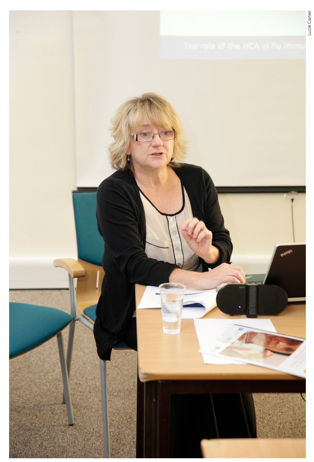
Students identified good relationships with academic staff as supportive and encouraging.