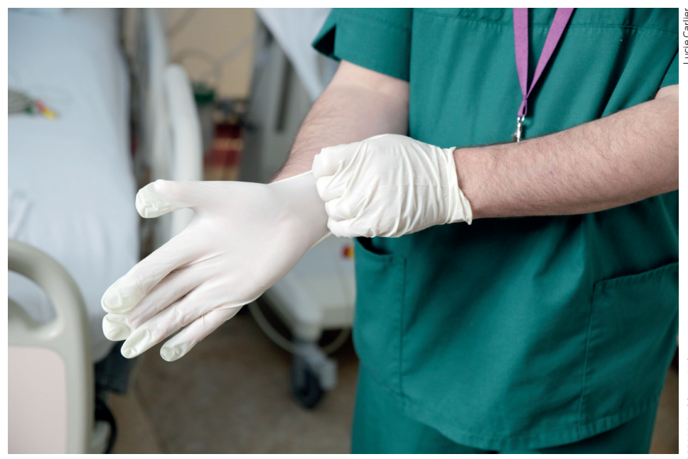
Nursing associates can progress to become a registered nurse.

The NA role will offer greater flexibility to the nursing workforce. With a clearly defined practice and education pathway,