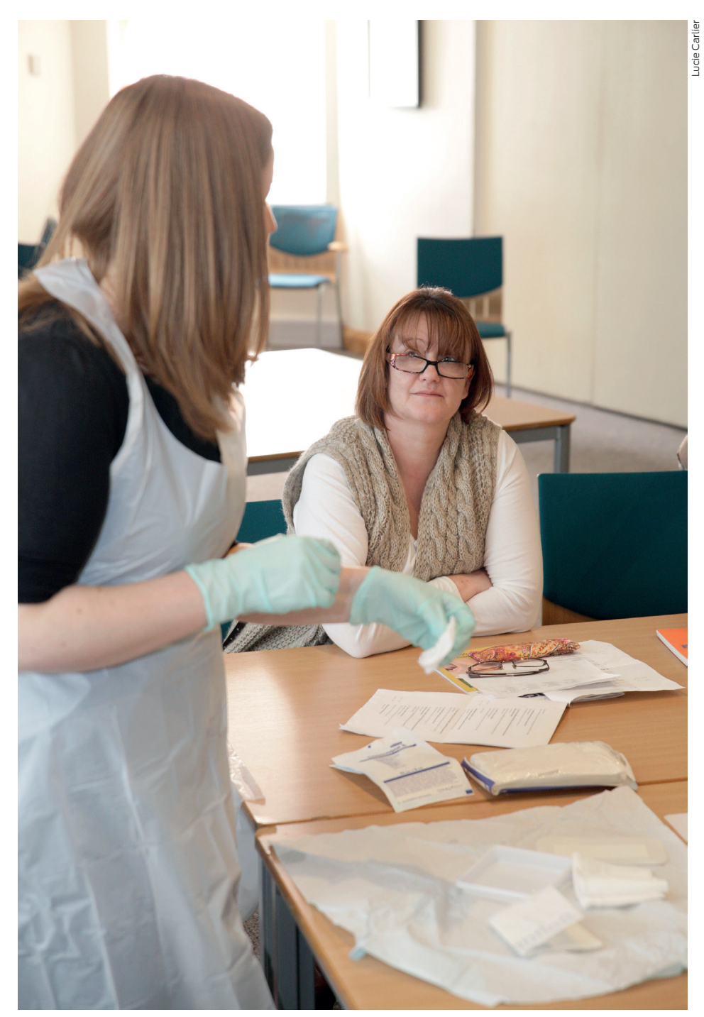
A lack of role models and those who have already qualified as a nursing associate has further added to the trainee nursing associates' confusion about their role.

of Caring review (Health Education England, 2015), which recommend that support workers should have clarity about and understand their own role and how it fits in with the team and the wider aims of the service. A lack of role models and those who have already qualified as a nursing associate has further added to the TNAs' confusion about their role.