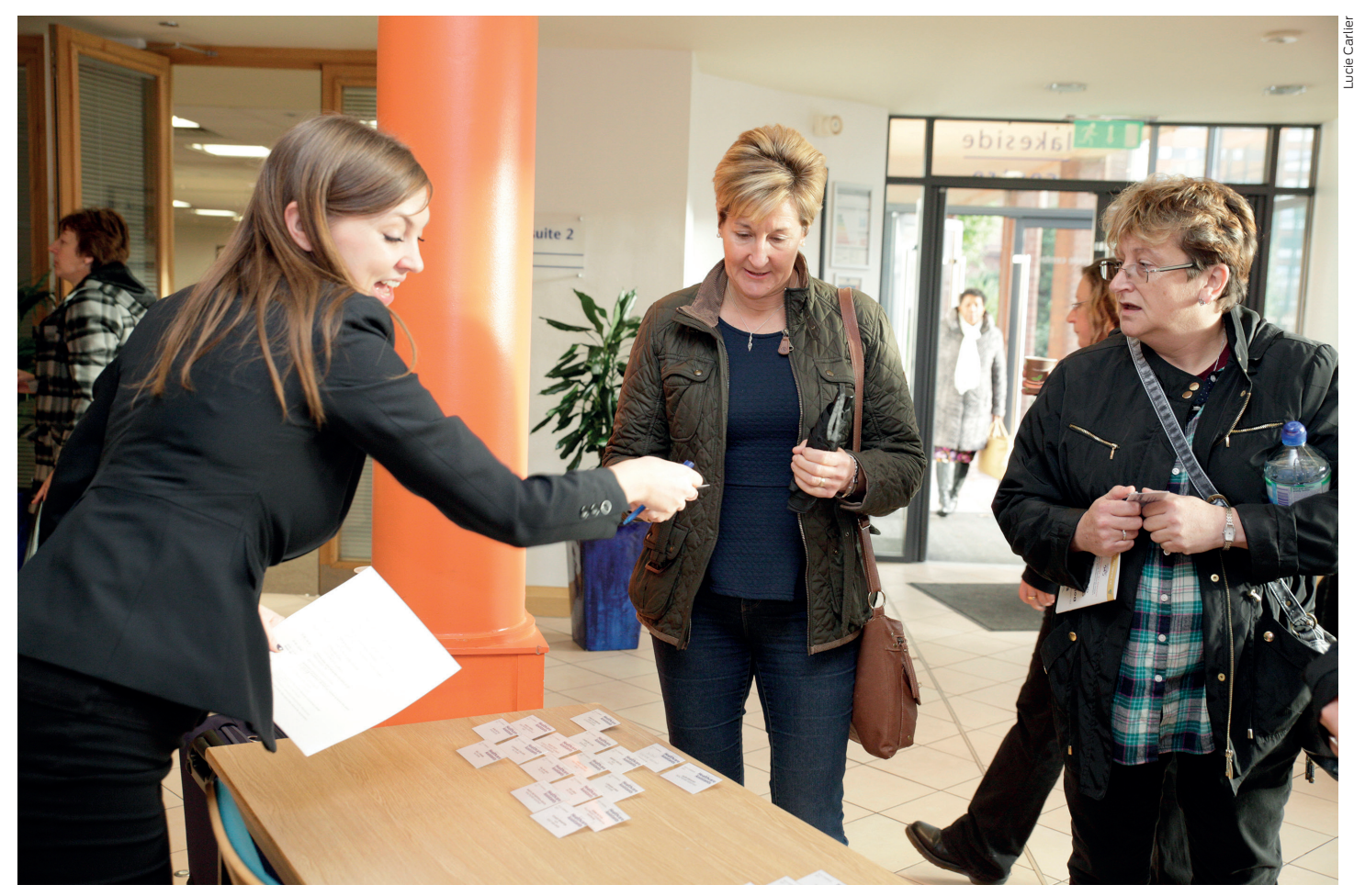
Aspiration could not always be met with clarity about clear progression pathways for trainee nursing associates.

The TNAS in the King et al (2020b) study describe progression as being seen as career development, from the moment the trainee commences the programme to those opportunities they hope will be afforded to them to step up to the role of registered nurse. This brought new knowledge and opportunities for a formally recognisable qualification, as well as financial recompense. However, aspiration could not always be met with clarity about clear progression pathways for TNAs (King et al, 2020b).