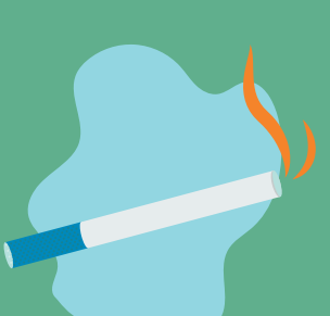
ask you if you or anyone in your house smokes