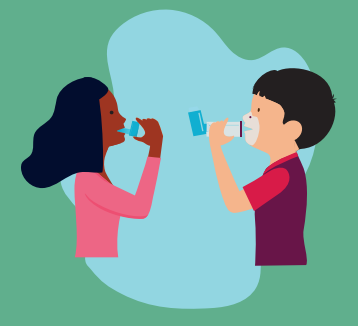
check that you know how to use your inhaler

Before you leave hospital, your doctor or nurse should: